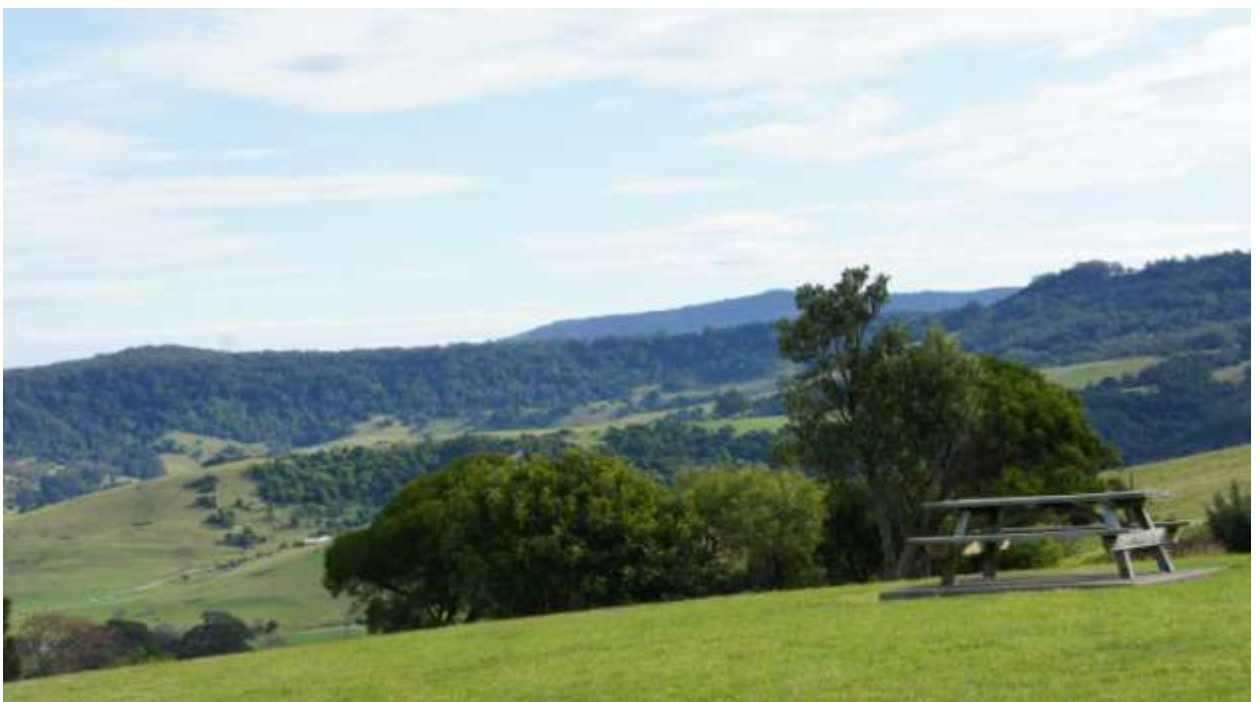
Kiama and the surrounding.